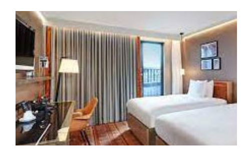
AT A GLANCE

This London landmark hotel has won a number of prominent Hilton service awards, including the coveted Brand of Excellence award.